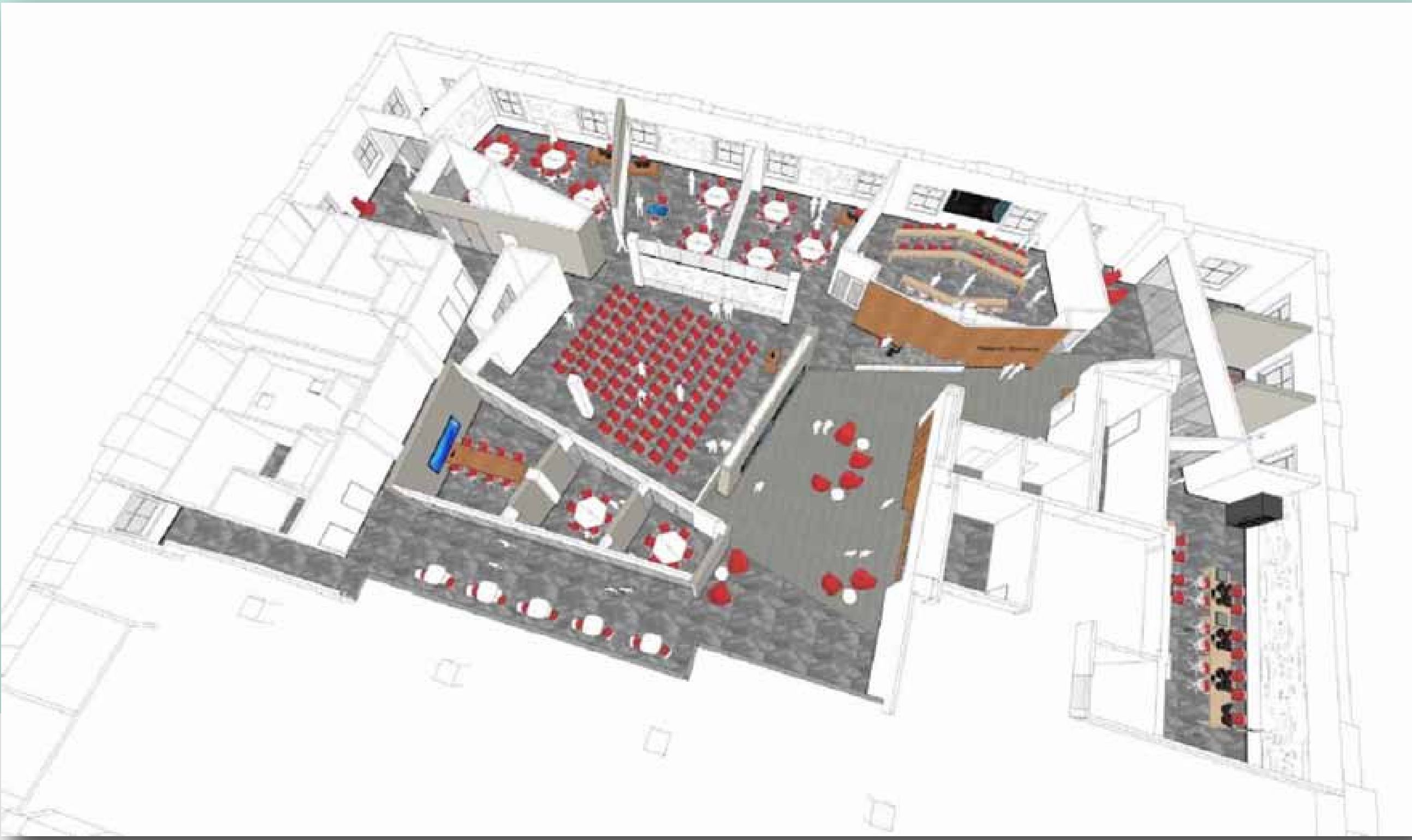
Renderings provided by BHDP Architecture.